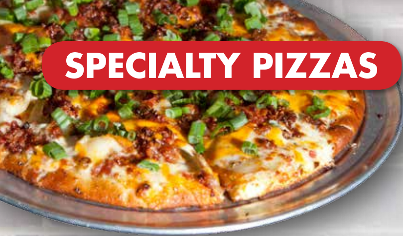
Potato Skin Pizza