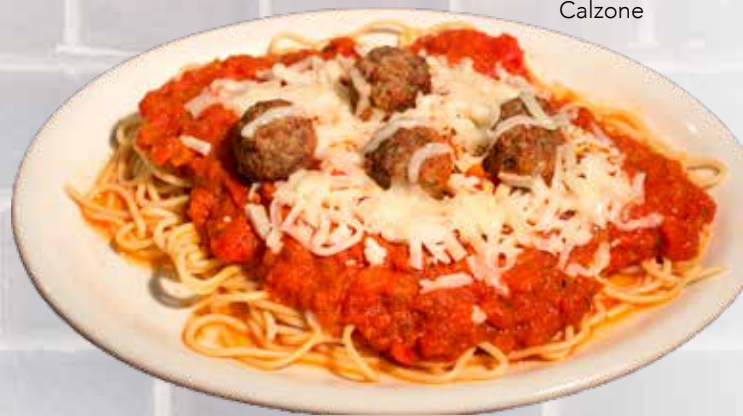
Spaghetti and Meatballs