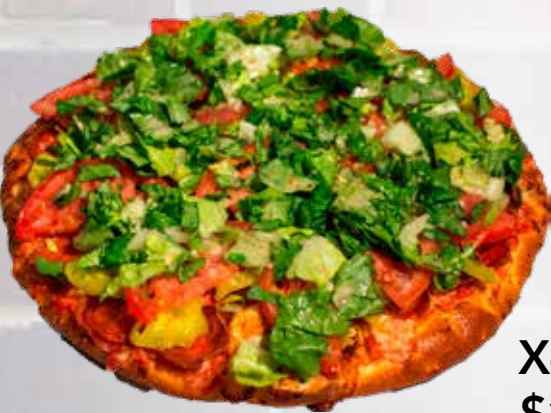
Santa Monica Pizza