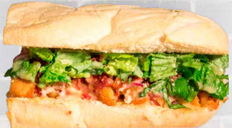
Honey Mustard Chicken Sandwich