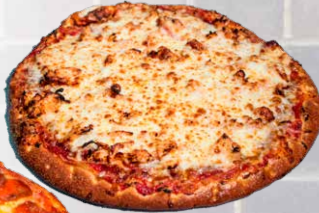
BBQ Chicken Pizza