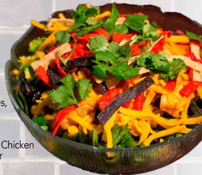
BBQ Chicken Salad

Chicken Caesar Salad.... $8.00 $10.25 Fresh Romaine Lettuce, Croutons, Shredded Parmesan and Tossed With Caesar Dressing, and Topped With Sliced Chicken Breast.