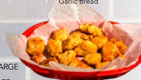
Boneless Chicken Bites