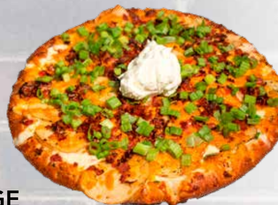
Potato Skin Pizza