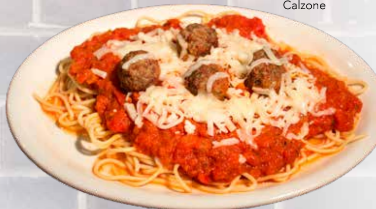
Spaghetti and Meatballs