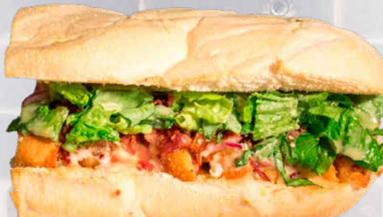
Honey Mustard Chicken Sandwich

Hot Pastrami Thinly Sliced New York Pastrami, 1000 Island Dressing, Melted Mozzarella, Mustard, Pickles and Lettuce 6" ..... $10.25 12" ..... $15.00